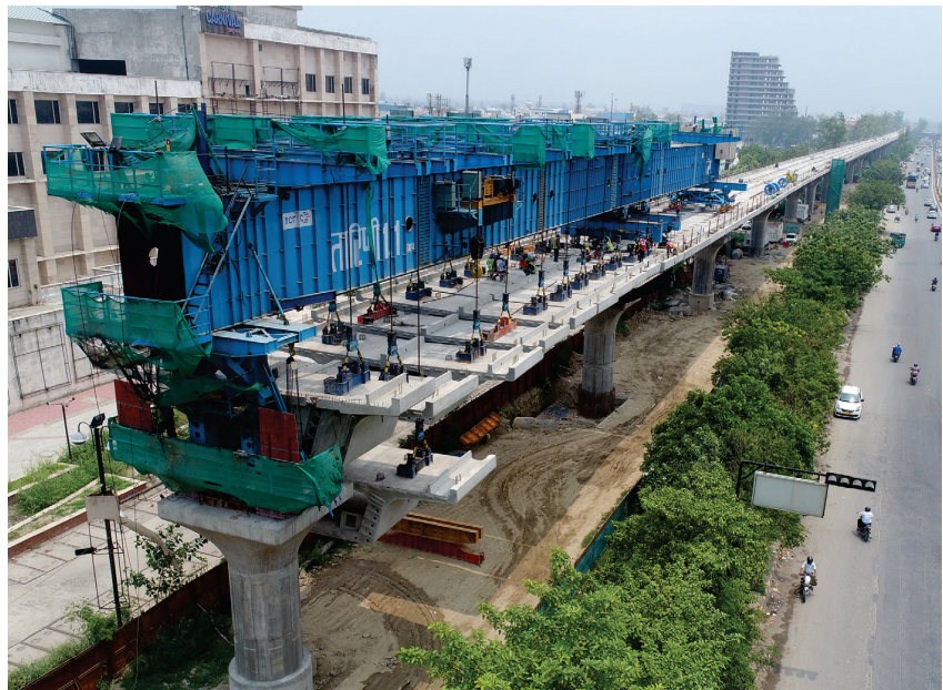
Construction on the first 82.5km line between Delhi and Meerut is progressing on schedule.

Systra and Aecom were appointed as detailed design consultants for the 62km section of the second line from Sherki Daula Toll Plaza in Gurugram to SNB. Work involves design for the stabling yard at Manesar, the depot at