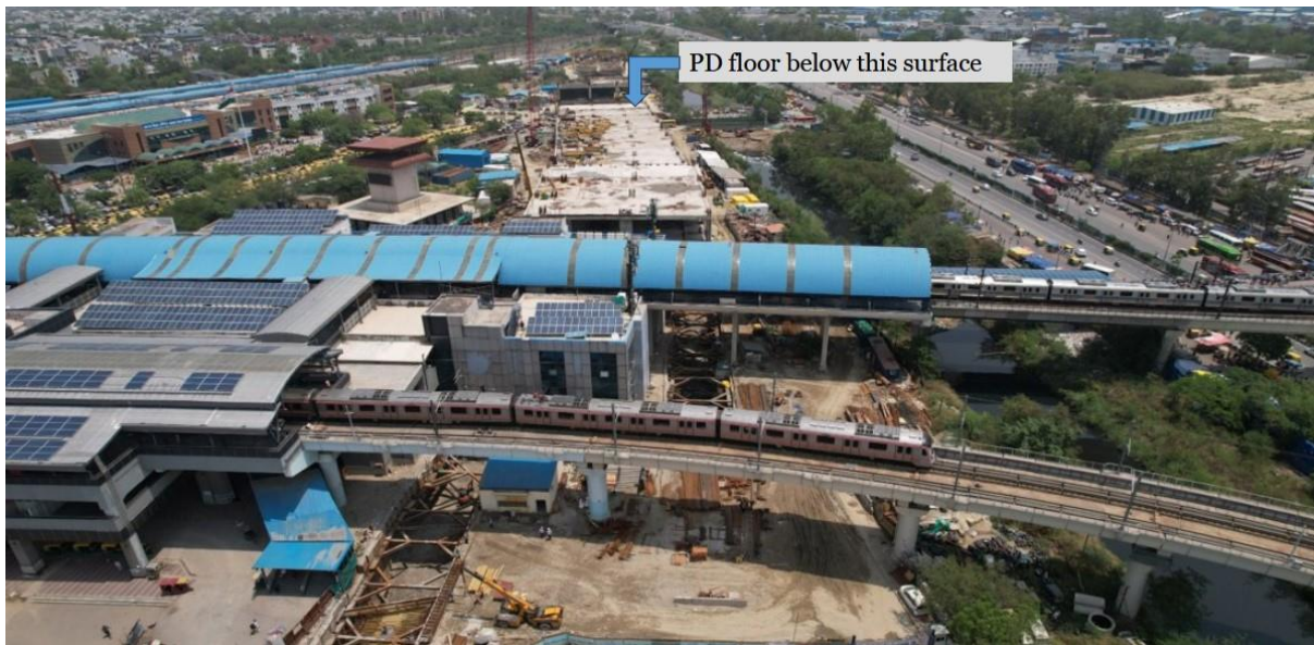
Fig: Actual picture of Anand Vihar station