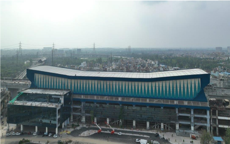
Fig: Actual photo of Ghaziabad station from available land parcel/Delhi metro side.