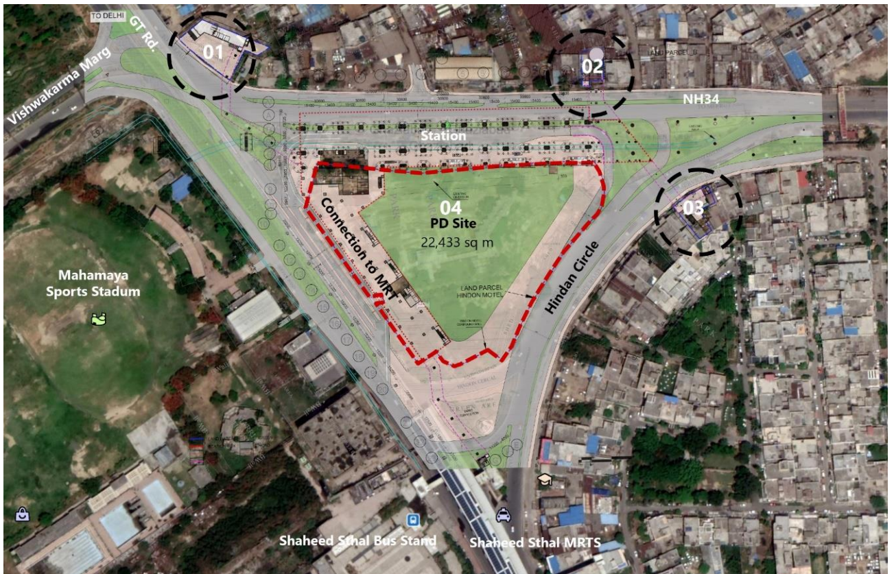
Fig: Showing the station location and available land parcel.